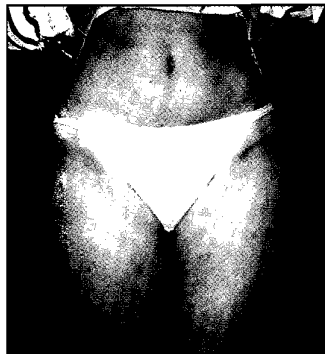
Suction lipectomy of hips - Postoperative result.