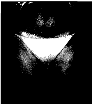
Suction lipectomy of hips - Prior to liposuction.

Other advantages of the new cannula include greater feathering of the suction tract, greater ability to resect scarred tissue (as in redo lipoplasty and lipoma procedures) and the ability to resect tissues other than fat, such as breast and organized lymphedematous tissue.