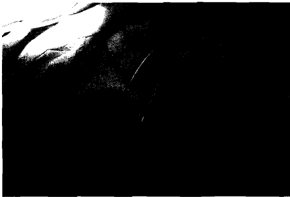
FIG. 3. Fill tube attached to a trocar.