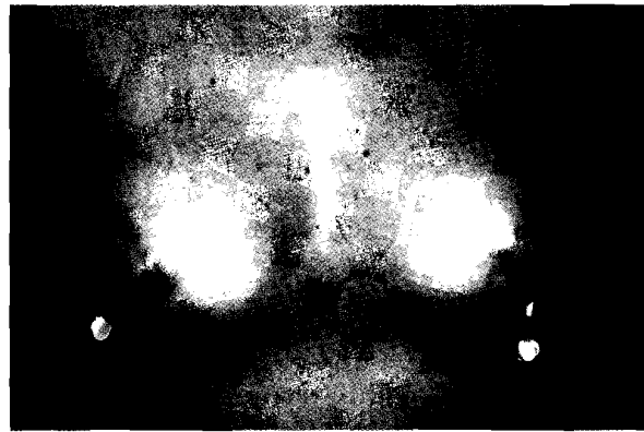
FIG. 6. Postoperative day 2. Saline is added via the domes.