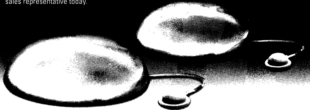
CAUTION: Investigational device. Limited by federal (United States) law to investigational use. This product is to be used only by a physician participating in a reconstruction core/adjunct or other approved products-use protocol sponsored by MENTOR, or a physician recognized as a clinical investigator identified in an approved Investigational Device Exemption.

Where two surgeries were once the only option, Becker implants are reshaping the way the entire industry looks at breast reconstruction surgery. To receive our free surgical technique video using Becker 25 and Becker 50 breast implants, call your local Mentor sales representative today.